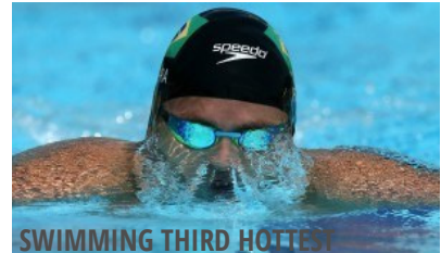
SWIMMING THIRD HOTTEST OLYMPIC TICKET IN FIRST WEEK OF SALES