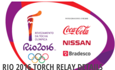
RIO 2016 TORCH RELAY DETAILS RELEASED; SCHEDULED TO VISIT 250 TOTAL CITIES IN BRAZIL